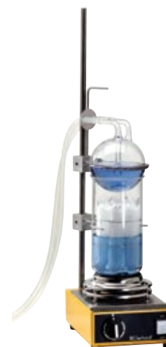
FibreBag FBS 6