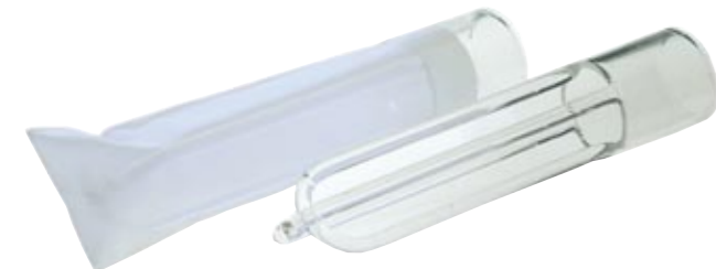
Highly precise filtration tissue with defined mesh size ensures optimal results